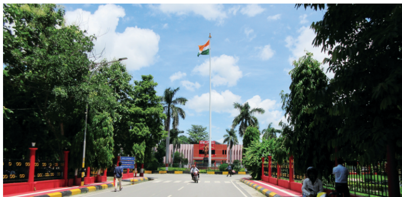
Main entrance of the university

"The early bird catches the worm," so MJPRU is determined to adopt a