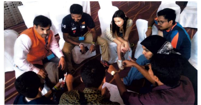
अपने अपने अनुभव Share करते Active Citizen