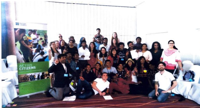
All Active Citizen Group Photo