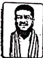
Shri Dharmendra Pradhan Hon'ble Union Minister of Education and Skill Development and Entrepreneurship