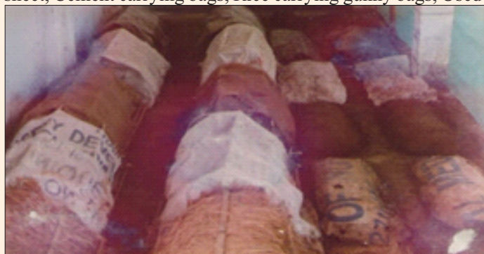
Fig. 1. Vermicompost beds covered with structured shades and as mulching

Five easy available shade materials like black polythene sheet, Cement carrying bags, Rice carrying gunny bags, Used