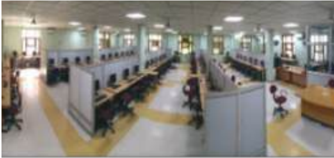
Computer Lab: Department of CSIT