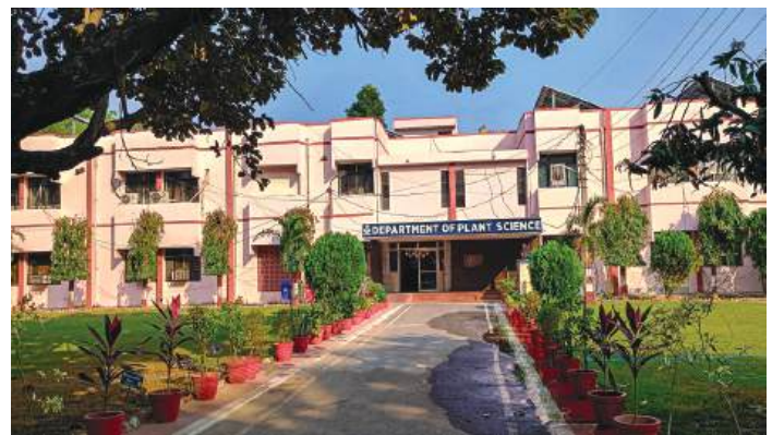
Department of Plant Science