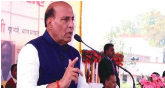
Hon. Shri Rajnath Singh (Defense Minister ) Addressing the audience in University