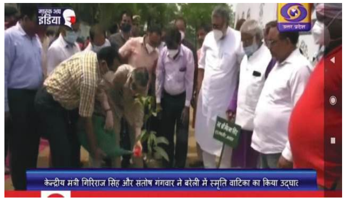
Hon'ble Ministers Shri Giriraj Singh and Shri Santosh Gangwar inaugurating the Smriti Vatika