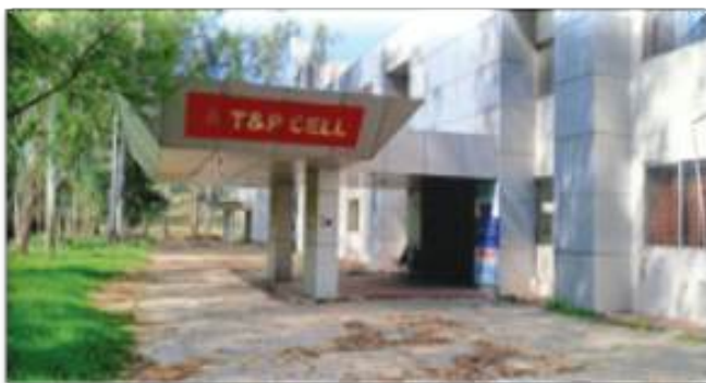
Training & Placement Cell