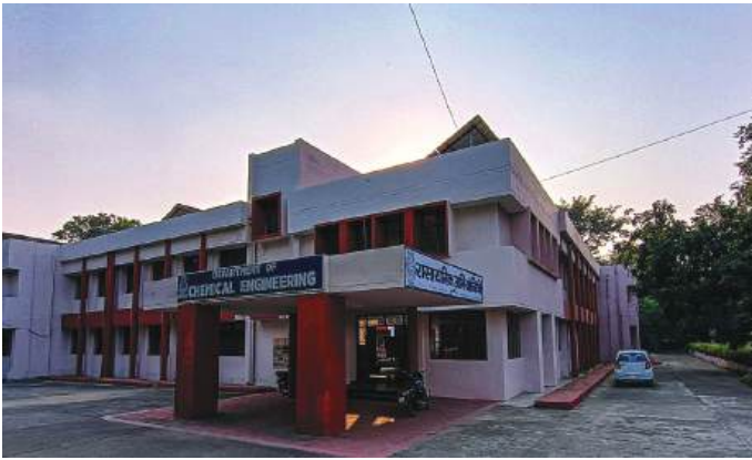
Department of Chemical Engineering