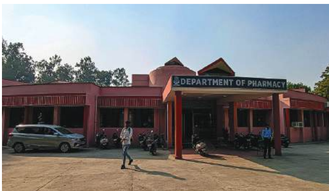
Department of Pharmacy