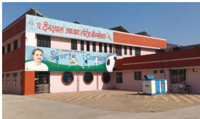
Pandit Deen Dayal Upadhyaya Sports Complex