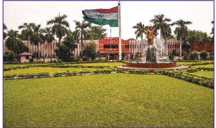
A Picture of Mahatma Jyotiba Phule showering his blessing to the visitors

The University imparts non-conventional, professional and technical education through its campus as well as network of colleges and institutes. It has, over the period, emerged as a pioneering institution in the state of Uttar Pradesh.