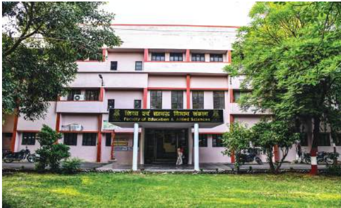
Faculty of Education and Allied Science