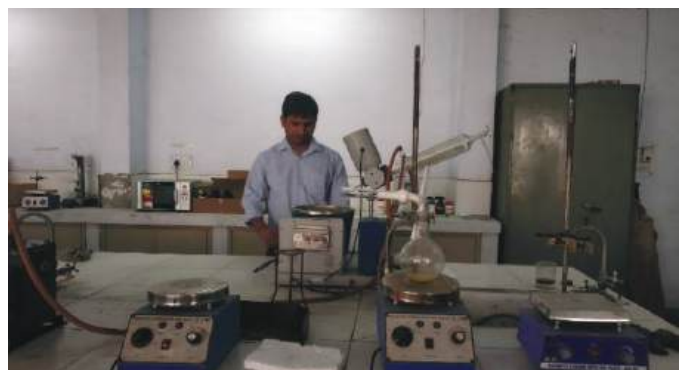
Organic Synthesis and Medicinal Chemistry