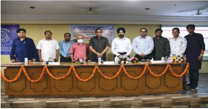
Launch of New Website on July 13 th , 2021