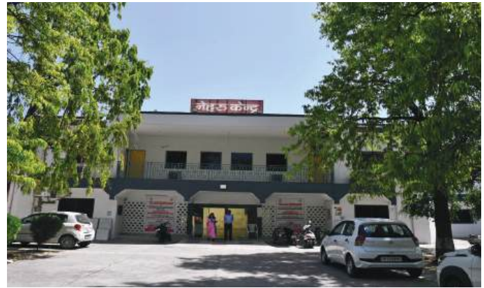
Pandit Deen Dayal Upadhyaya Shodh Peeth, Directorate of Research, Office of Dean Academic, IQAC & Ranking Cell of University