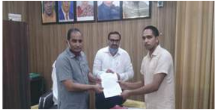
Hon ble Vice Chancellor giving Appointment letter