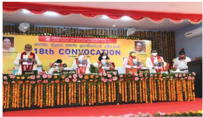
Release of Annual report during 18 th convocation, Bareilly