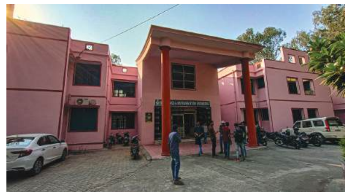
Department of Electronics and Instrumentation