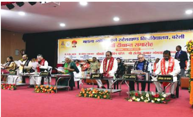
Hon'ble Chancellor, M. J. P. Rohilkhand University participated in Convocation