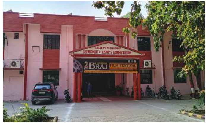
Department of Business Administration