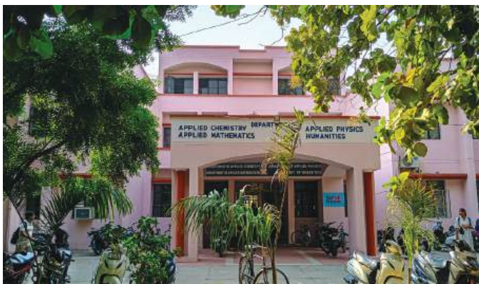
Humanities, Applied Physics, Applied Mathematics & Departments of Applied Chemistry,