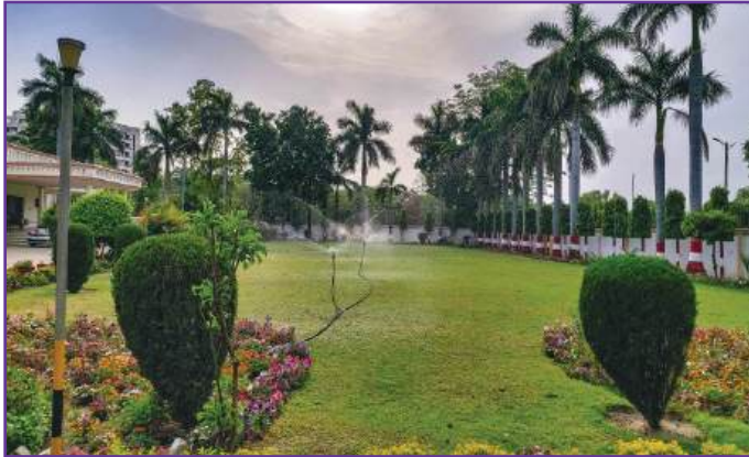
Lust green Campus

Bareilly, Baduan, Pilibhit and Shahjahanpur. The University campus spreads over 206 acre of Land. The Campus possesses administrative building, faculty buildings, Central Library, Atal Auditorium, 05 Boys Hostel & 04 Girls Hostels, residences for officers of the University, faculty members, Non-teaching staff, Guest houses and Sports complex. It has also a health care centre managed by experienced team of Doctors from Rajshree Medical College. The senior faculty members of different disciplines in Humanities, Science and Technology are running various research projects funded by different agencies and so far more than 150 projects funded by UGC, AICTE, DST, CST, ICAR, ICHR, MIF and state Government have been completed. Teachers of the affiliated colleges are also engaged in research projects funded by various agencies.