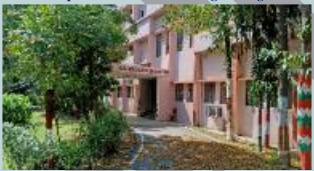
Faculty of Education and Allied Science