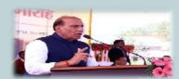
Hon. Shri Rajnath Singh (Defense Minister ) Addressing the audience in University