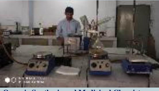
Organic Synthesis and Medicinal Chemistry Research Lab