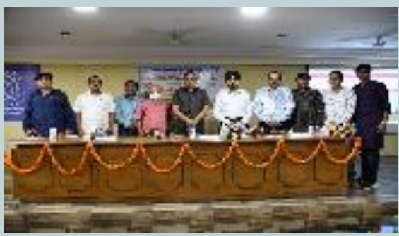
Launch of New Website on July 13th, 2021