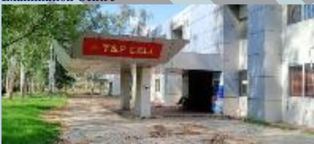
T & P Cell