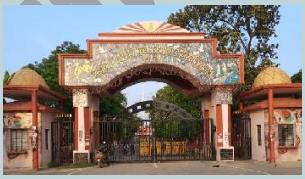
Welcome to the Campus of MJPRU Bareilly