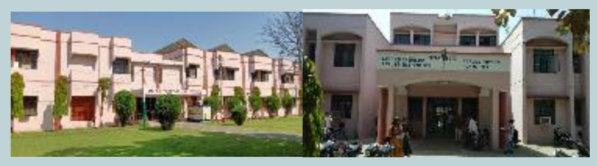
Department of Plant Science