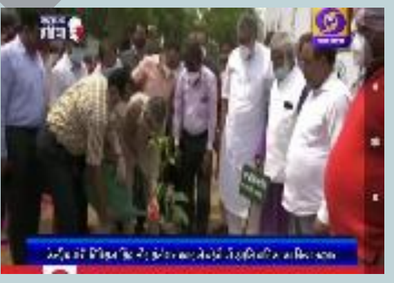
Hon'ble Ministers Shri Giriraj Singh and Shri Santosh Gangwar inaugurating the Smriti Vatika