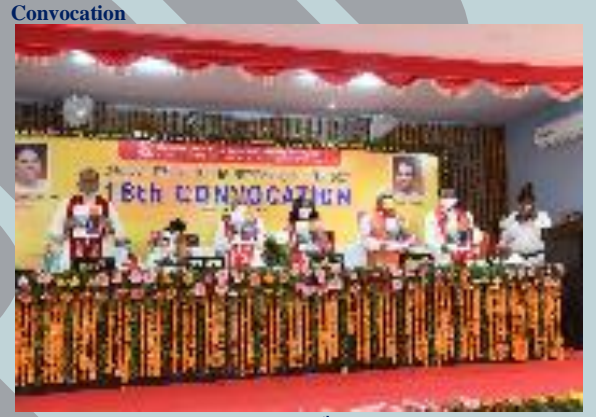
Release of Annual report during 18th convocation, Bareilly