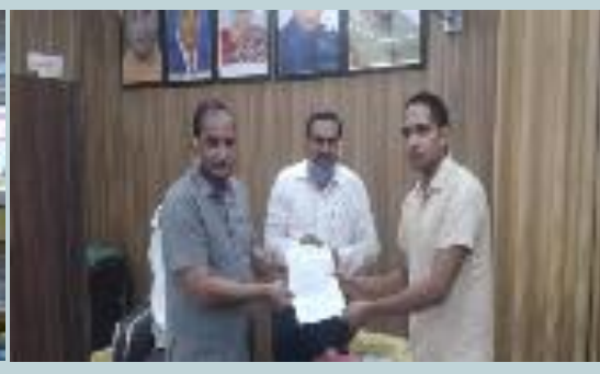
Hon"ble Vice Chancellor giving Appointment letter to son of a faculty deceased due to Corona