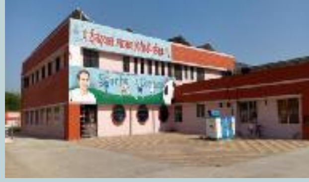
Pandit Deen Dayal Upadhyaya Sports Complex