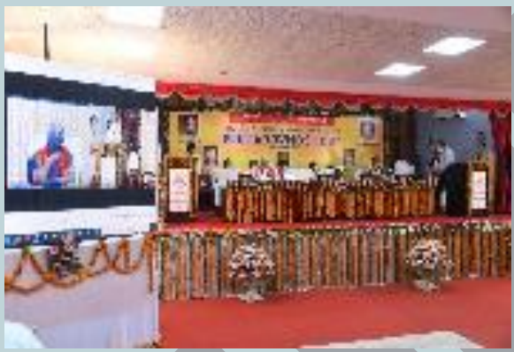
Hon'ble Chancellor, M. J. P. Rohilkhand University participated virtually in 18th Convocation