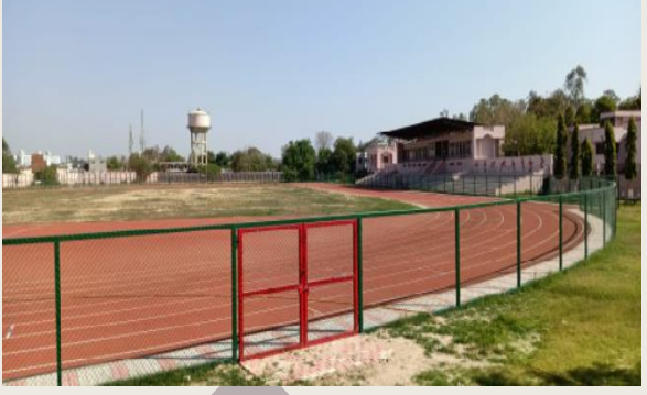
Pandit Deen Dayal Upadhyaya Sports Complex

International Standard- Synthetic Running Track