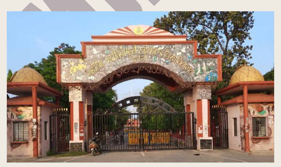
Welcome to the Campus of MJPRU Bareilly