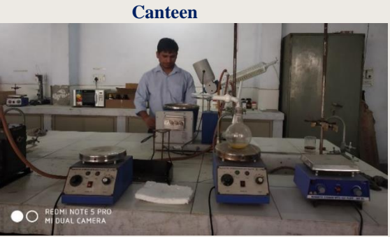
Organic Synthesis and Medicinal Chemistry Research Lab