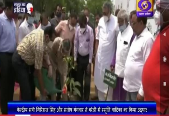
Hon'ble Ministers Shri Giriraj Singh and Shri Santosh Gangwar inaugurating the Smriti Vatika