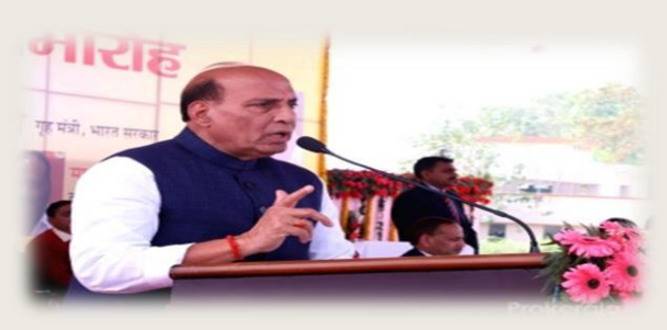
Hon. Shri Rajnath Singh (Defense Minister ) Addressing the audience in University